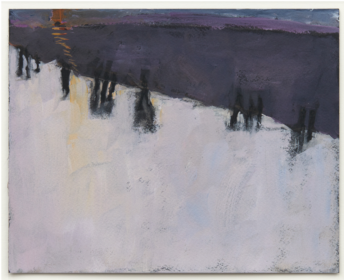
Reggie Burrows Hodges Isolation Tour: Adrift, Surging, 2020 Acrylic and pastel on black paper vellum surface 8 × 10 in (20.3 × 25.4 cm) RBH 2