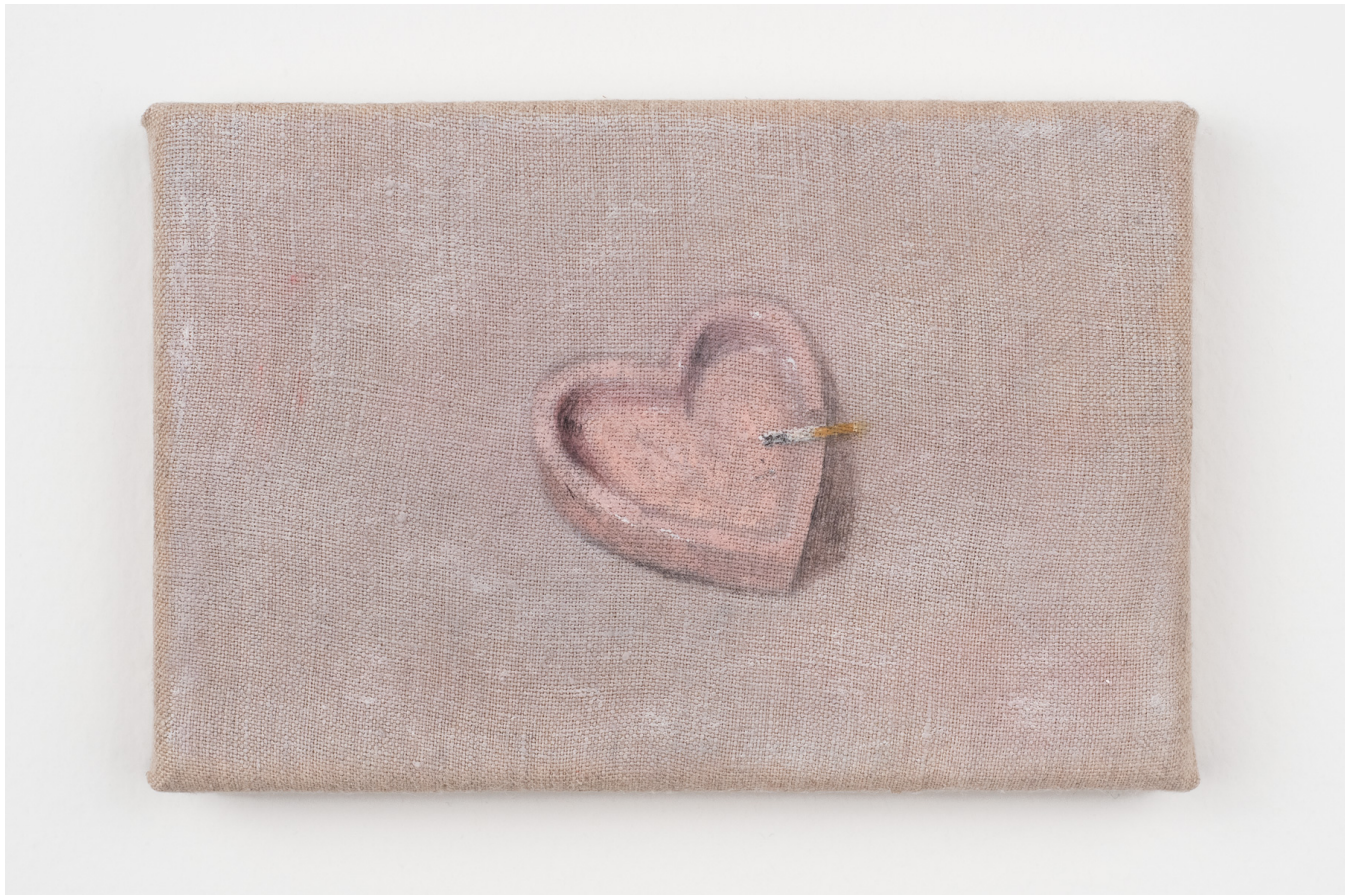
Katelyn Eichwald Sweetheart , 2021 Oil on linen 6 × 4 in (15.2 × 10.2 cm) EICH I