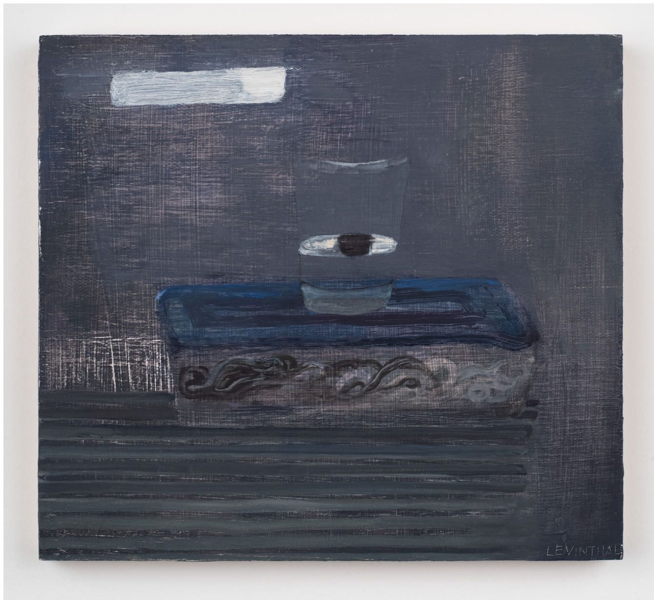
Aubrey Levinthal Water and Spaghetti Leftovers , 2020 Oil on panel 11 ½ × 10 ½ in (29.2 × 26.7 cm) LEVI I