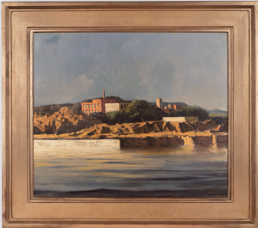
Hughie Lee-Smith Construction Area , 1962 Oil on canvas 22 × 26 in (55.9 × 66 cm) HLS I