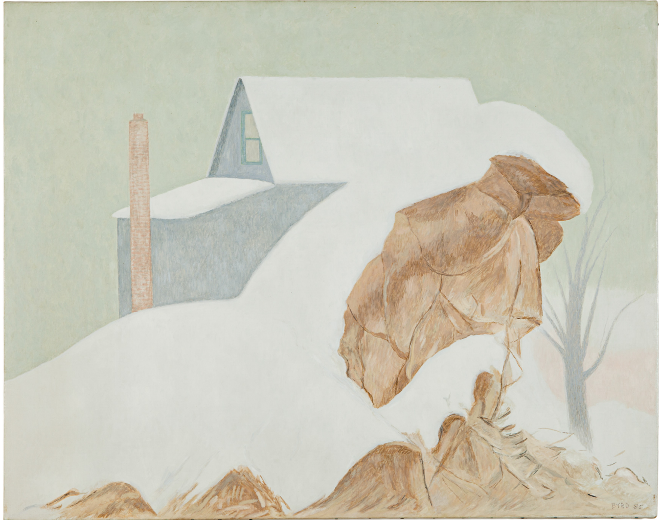
David Byrd House In Snow , 1985 Oil on canvas 27 × 34 in (68.6 × 86.4 cm) BYRD 42