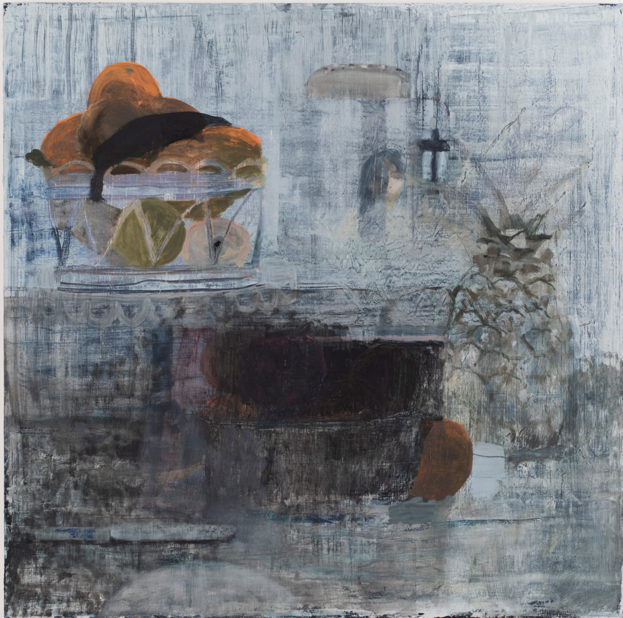
Aubrey Levinthal Fruit with Toaster Reflection , 2017 Oil on panel 24 × 24 in (61 × 61 cm) LEVI 2