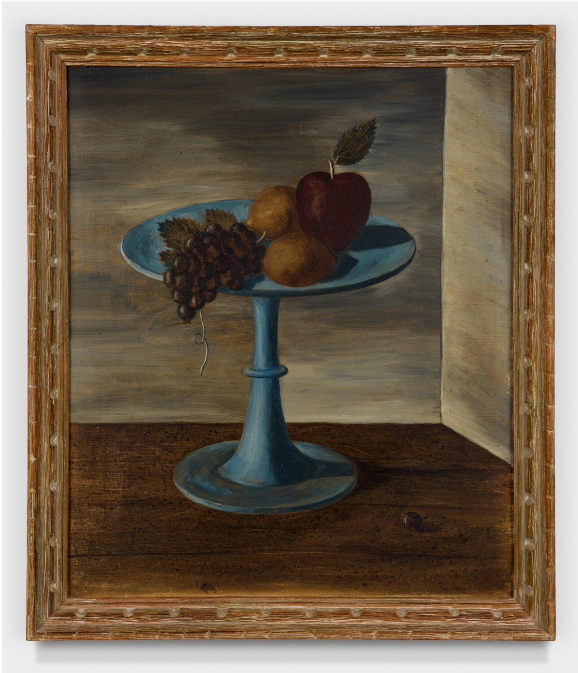
Gertrude Abercrombie Fruit Compote , 1938 Oil on board 12 × 10 in (30.5 × 25.4 cm) GABE I