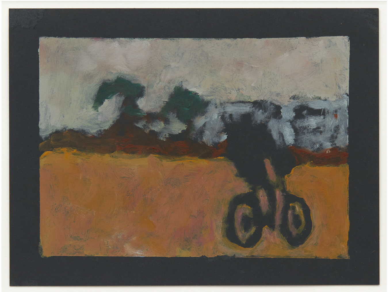
Reggie Burrows Hodges Isolation Tour: Adrift, Spin Cycle, 2020 Acrylic and pastel on black paper vellum surface 9 in (22.9 cm) RBH I