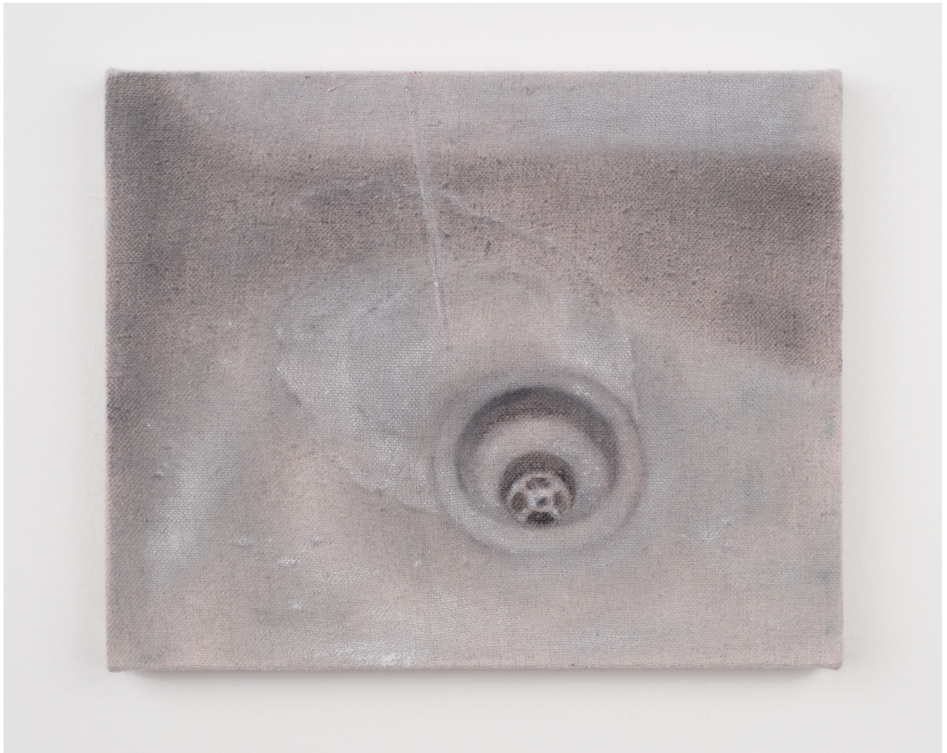
Katelyn Eichwald Gone , 2021 Oil on linen 8 × 10 in (20.3 × 25.4 cm) EICH 2