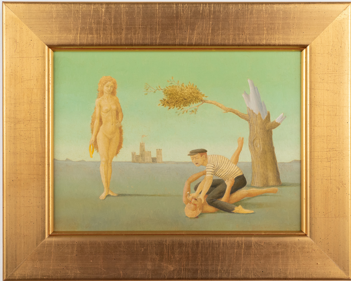
John Wilde The Blinding of Sampson Within View of his Castle , 2000 Oil on canvas 7 × 9¾ in (17.8 × 24.8 cm) JWIL I