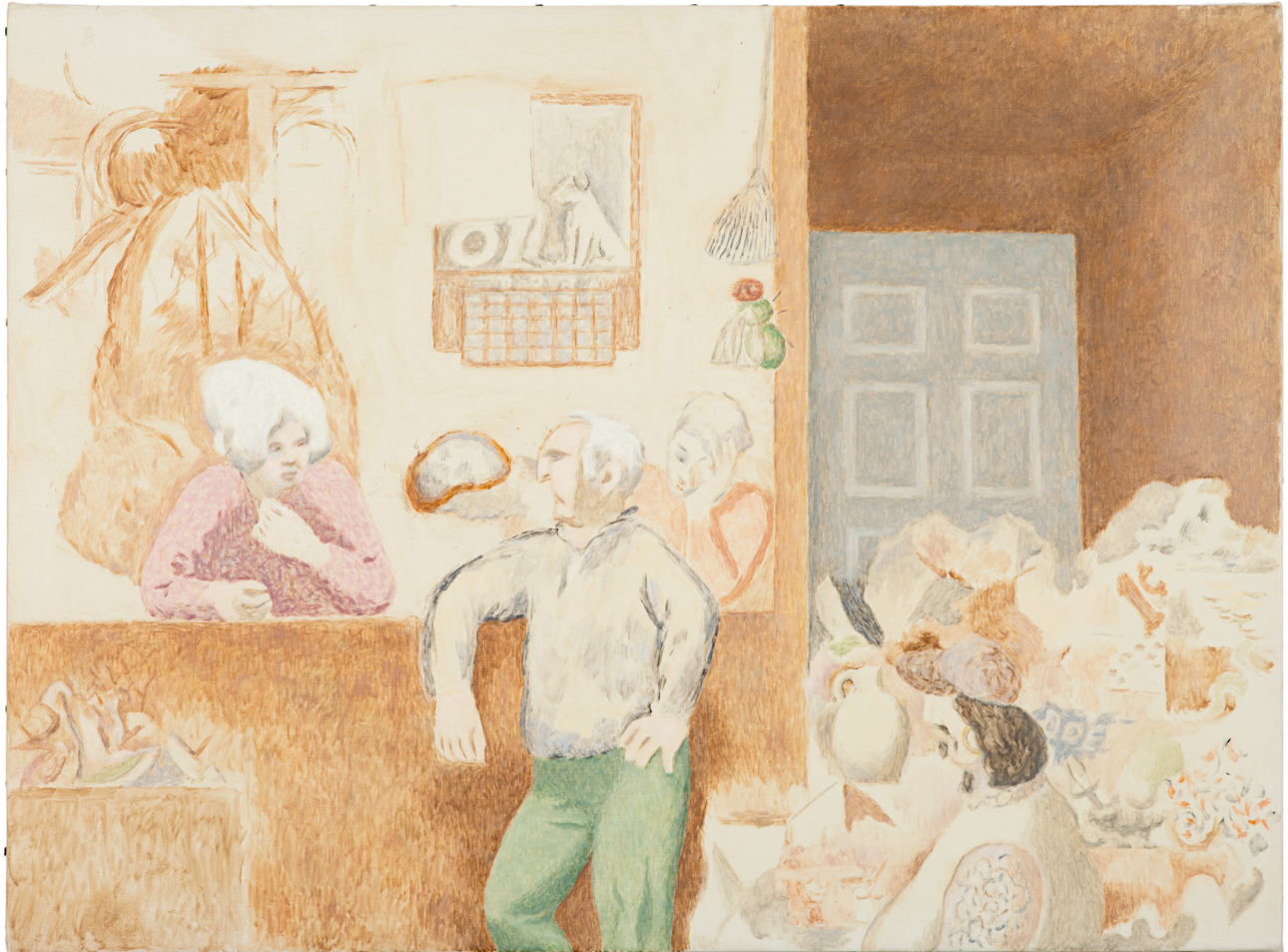
David Byrd The Blue Door , n.d. Oil on canvas 20 × 27 in (50.8 × 68.6 cm) BYRD 44