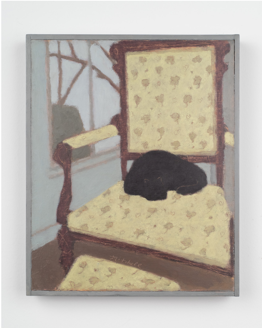
John Joseph Mitchell Cat Nap on a Floral Upholstered Chair , 2021 Oil on panel with artist's frame 12 3 / 4 × 10 3 / 8 in (32.4 × 26.4 cm) JJM 6