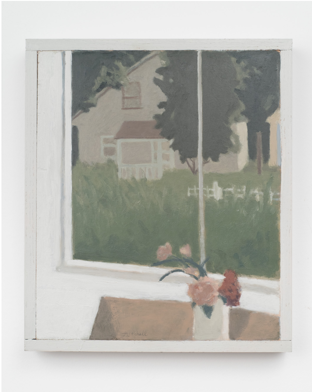
John Joseph Mitchell Flowers at the Front Window , 2021 Oil on panel with artist's frame 13 3 / 4 × 11 3 / 4 in (34.9 × 29.8 cm) JJM3