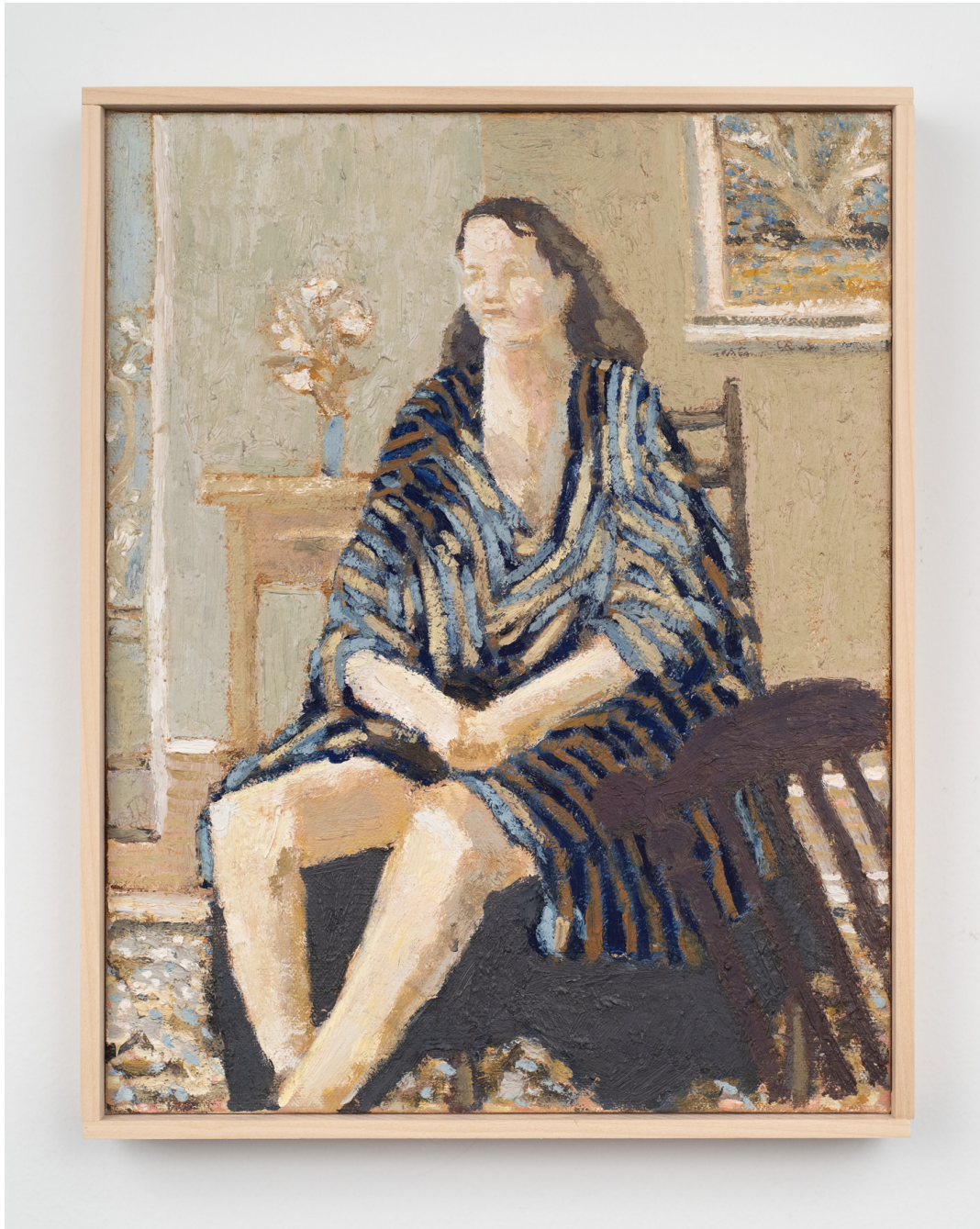
John Joseph Mitchell Blue Striped Robe , 2019 Oil on canvas with artist's frame 14½ × 11½ in (36.8 × 29.2 cm) JJM I