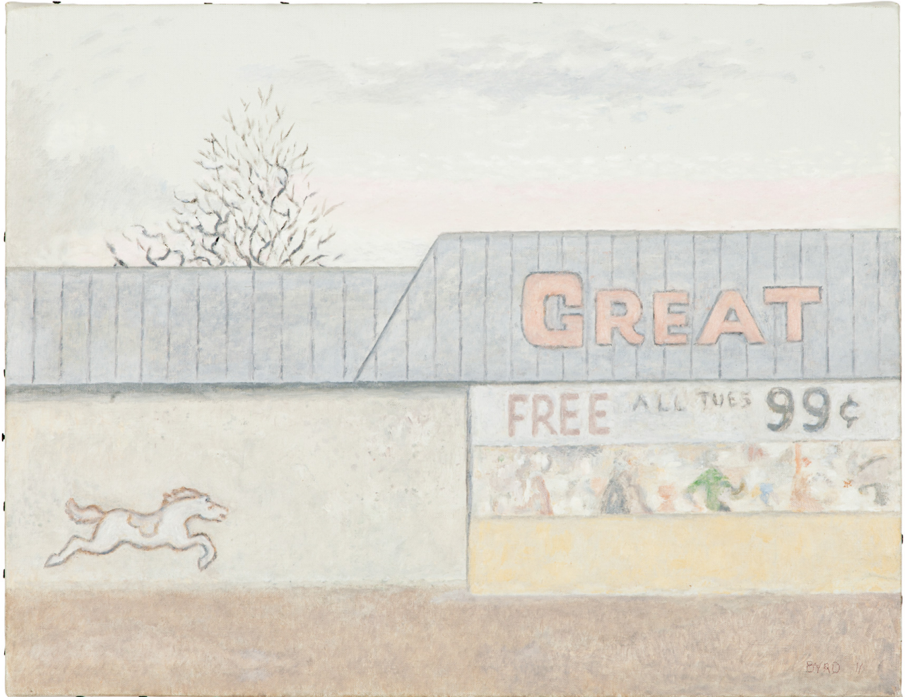
David Byrd Horse and Great , 2011 Oil on canvas 15 × 19 in (38.1 × 48.3 cm) BYRD 43