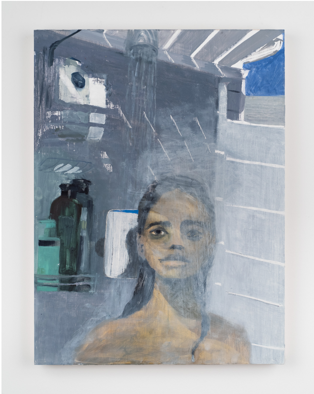
Aubrey Levinthal Outdoor Shower , 2021 Oil on panel 24 × 18 in (61 × 45.7 cm) LEVI 4