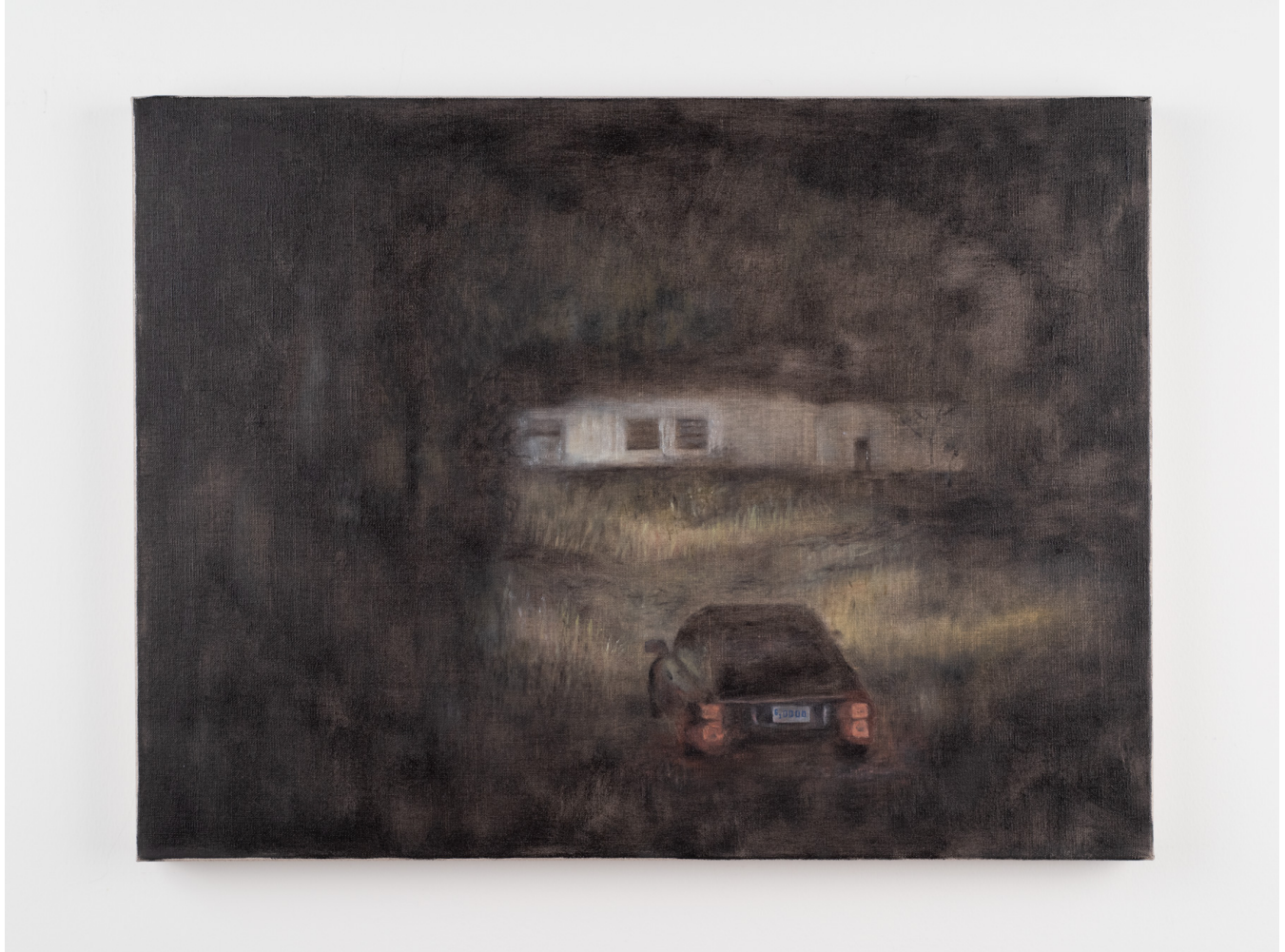
Katelyn Eichwald Here , 2021 Oil on linen 18 × 24 in (45.7 × 61 cm) EICH 3