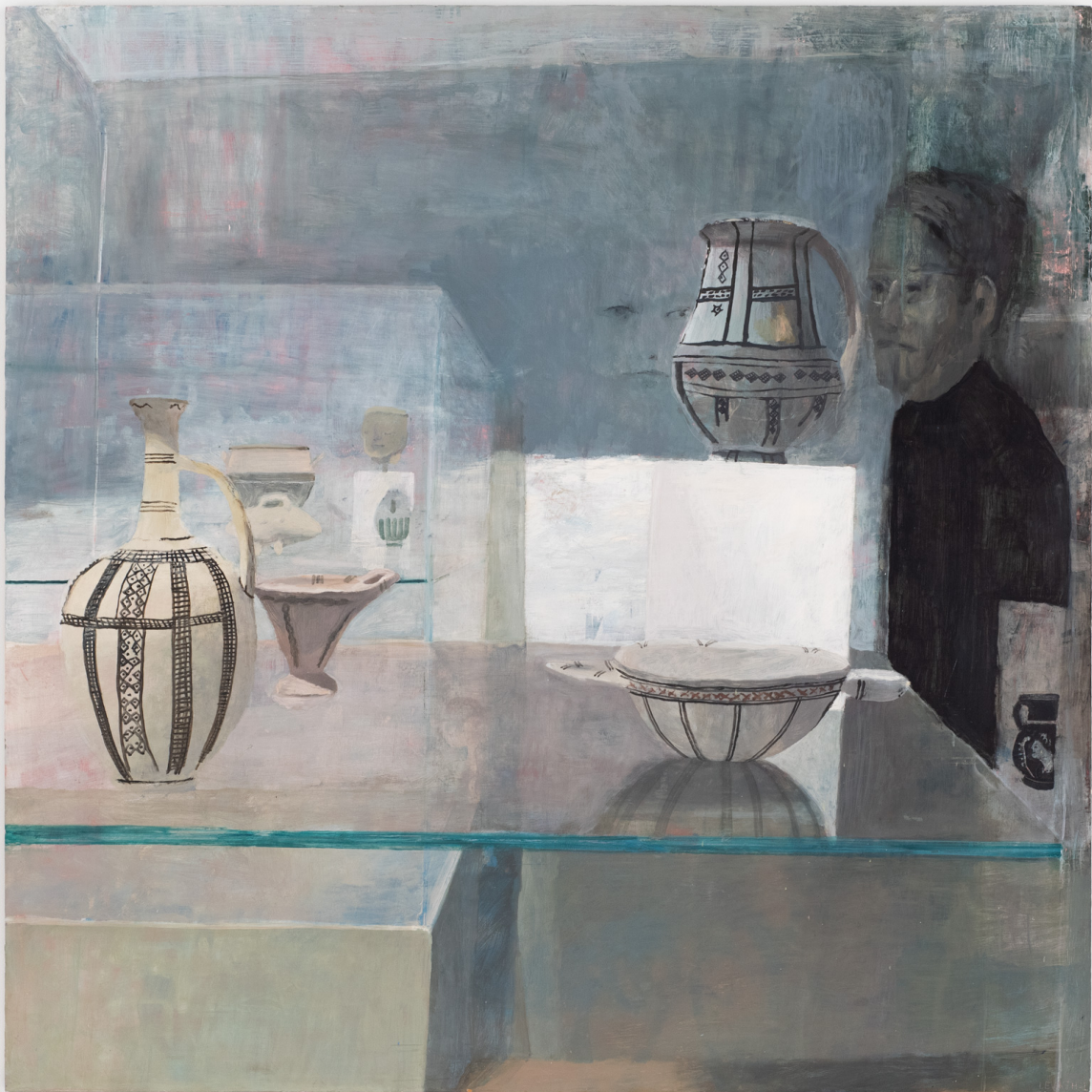
Aubrey Levinthal Antiquities Enthusiast , 2018 Oil on panel 48 × 48 in (121.9 × 121.9 cm) LEVI 3