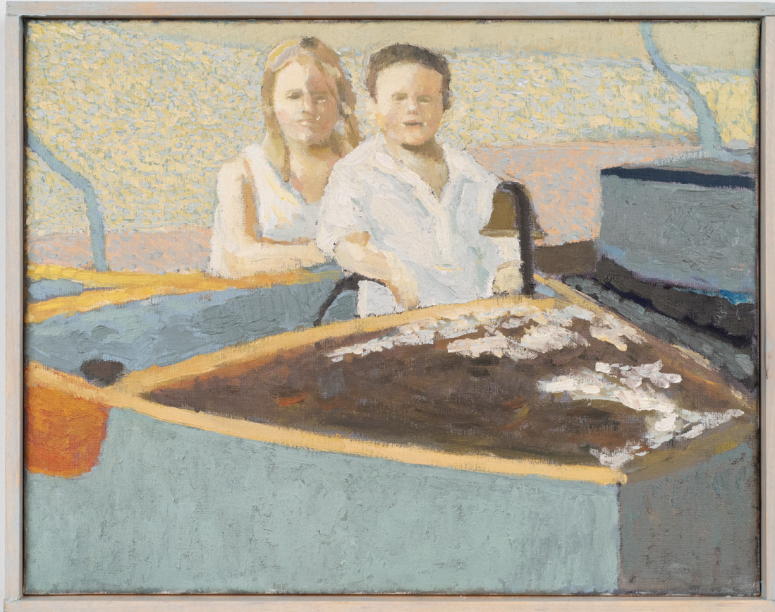
John Joseph Mitchell Boat Ride at the Amusement Park , 2019 Oil on canvas with artist's frame 11 ½ × 14 ½ in (29.2 × 36.8 cm) JJM5