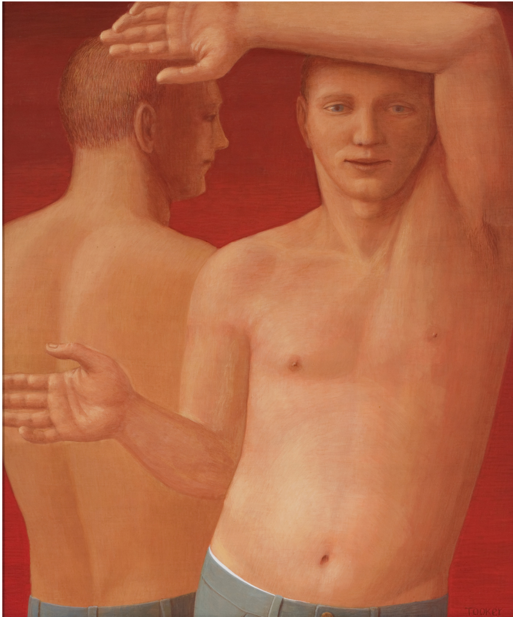
George Tooker Window XI , 1999 Egg tempera on gessoed panel 24 × 20 in (61 × 50.8 cm) TOOK I